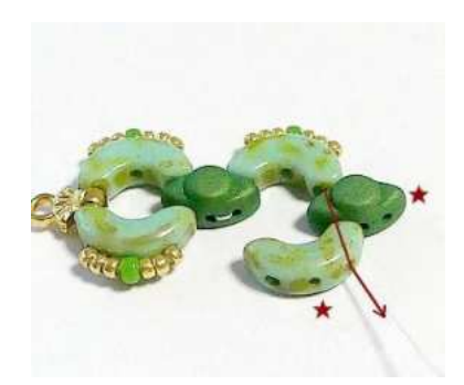
6) Insert 1 Volos and 1 Arcos