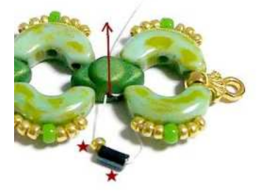
10) Insert 1 Bugle and 1 SB15 through the central hole of Volos