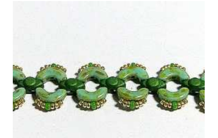
8) Insert 28 Arcos. Here is the result 😊