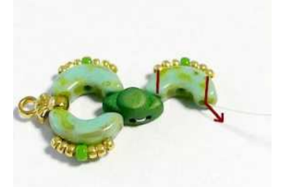
5) Insert 1 Arcos, 3 SB15, 1 SB11 and 3 SB15 through the Arcos HERE