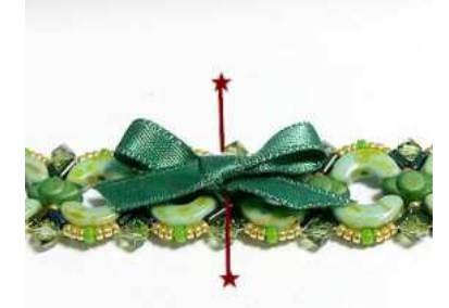
20) On the central Volos, make a pretty bow in the center of your bracelet Compliments ! The bracelet « Lady » © is finished