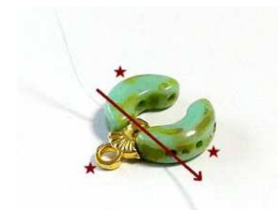
1) Insert 1 Arcos, 1 Pilos and 1 Arcos