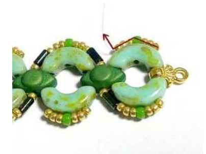
14) Here is the result 😇 Exit through seed beads HERE