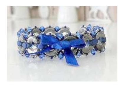
21) Another color 😊

I wish you a happy beading. I offer you this pattern.