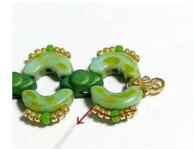
9) Exit HERE through the seed beads 😊