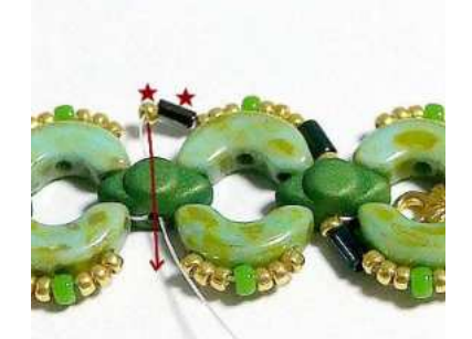
12) Insert 1 Bugle and 1 SB15 through the central hole of Volos