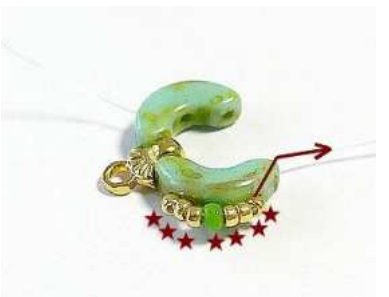
2) Insert 3 SB15, 1 SB11 and 3 SB15 through the third hole of Arcos HERE