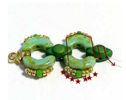
7) Repeat from step 4